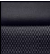
C&T Tédéo / Eka