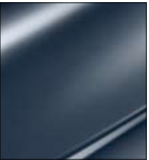
Iron Grey (Pearlescent)