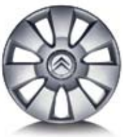
Narcisse 16" Wheel Trims