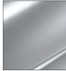
Arctic Steel (Metallic)