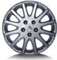
Vivace 16" Alloys